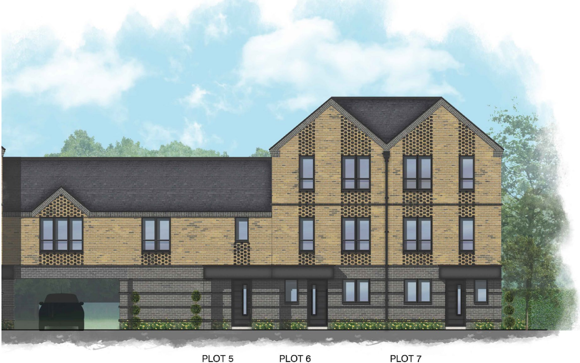
PLOT 5 PLOT 6

PLOT 2 PLOT 4 PLOT 1 PLOT 3 FRONT ELEVATION