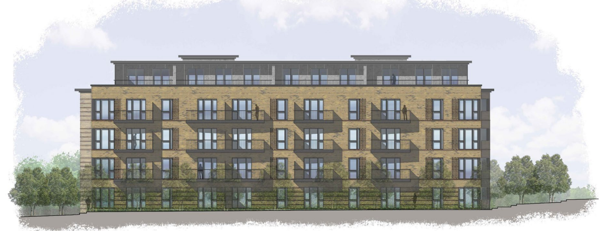
BUILDING A - NORTH ELEVATION

9.29 The design and external appearance of the two apartment blocks is considered acceptable in this location. The height, bulk and mass of the blocks are considered to be appropriate within the context of the site and the surrounding area. Immediately west and north west of the site are apartment buildings in Mount Lane and Mount Pleasant which are three and four storeys in height. The previous scheme for this site also proposed apartment buildings of four and five storeys in height and this was considered to be acceptable. The proposed materials include a buff brick to the main façade with a dark grey brick plinth which would also be used for the recessed cores, and some vertical elements in the facades. Light cladding materials are proposed on the upper floors where the accommodation steps back from the main facade. Full details of the materials can be secured through an appropriate condition. Balconies will be provided on each apartment building.