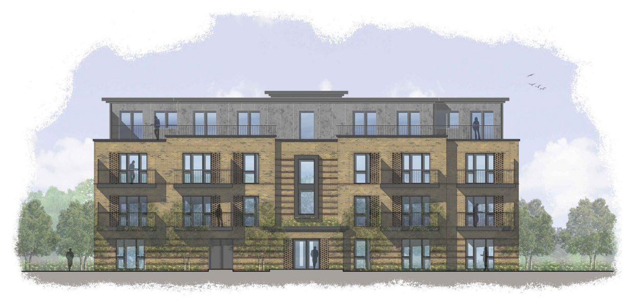
BUILDING B - NORTH ELEVATION